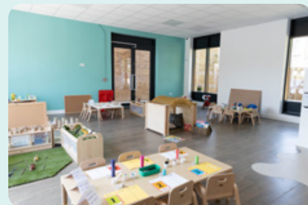
Example of internal space