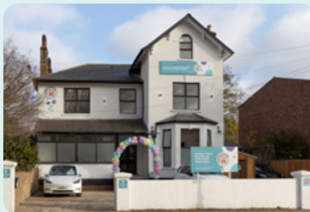
Example of building frontage with parking