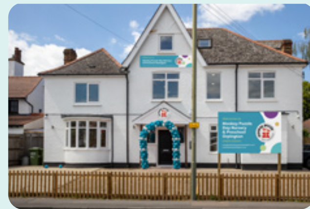
Example building frontage with parking