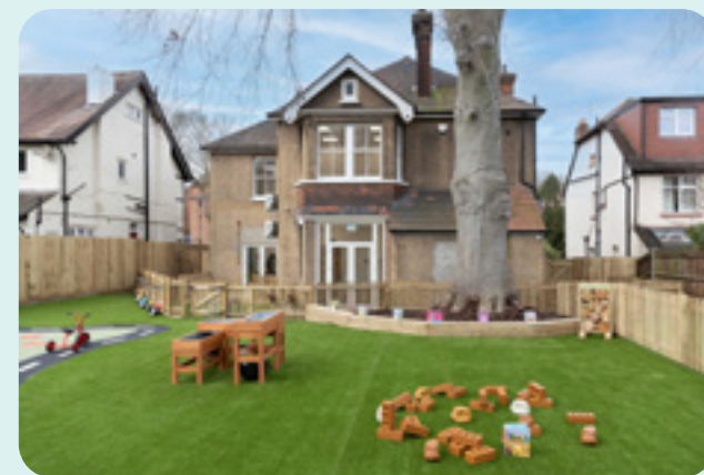
Example of outdoor space