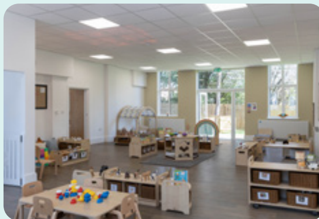
Example of internal space