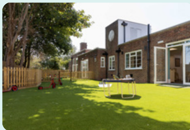
Example of outdoor space